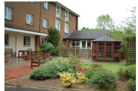
Seymour House, Dunmurry